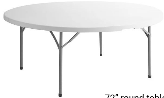
72" round tables up to 10 available ($15 each)