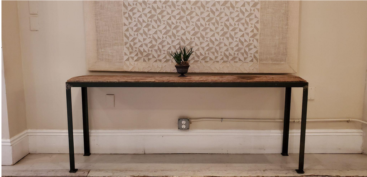
2 console tables 73"w x 14"d x 29"h