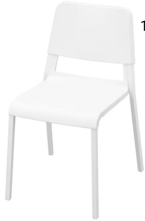
100 White Chairs ($5.50 each)