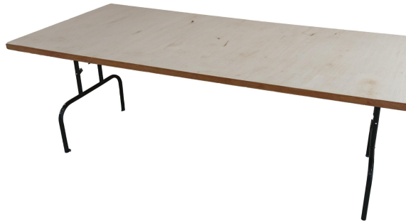
7'X36" rectangular tables up to 5 available ($10 each)