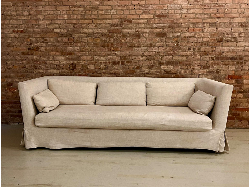
2 couches 8'w x 41"d