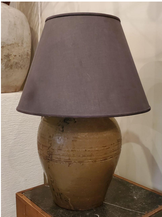
2 table lamps 32"h x 24" round