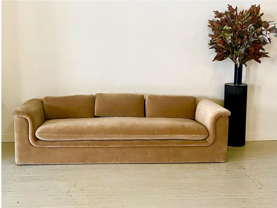
1 couch 8'w x 41"d