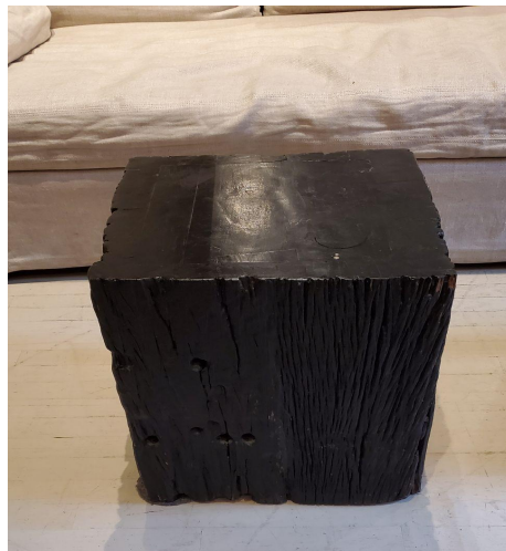
2 square marmorized wood blocks 16" x 16" x 18"