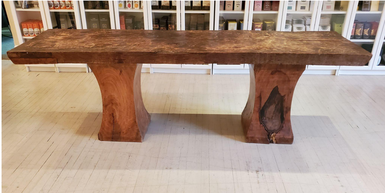
1 wood antique table 102"w x 26"d x 31"h