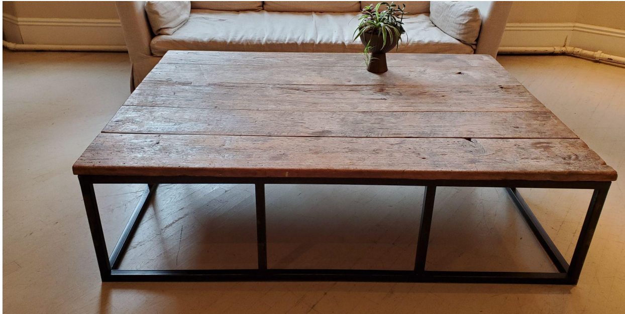
1 coffee table 49"d x 69"w x 18"h