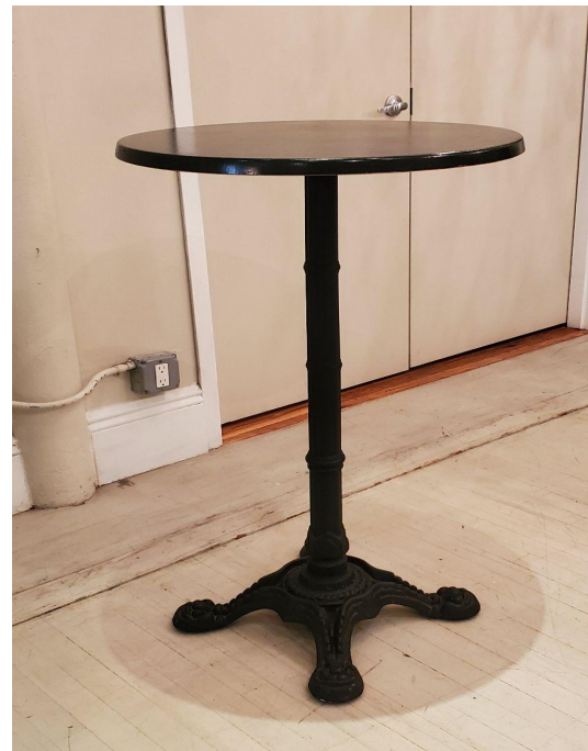
4 high tops 42"h x 24" round