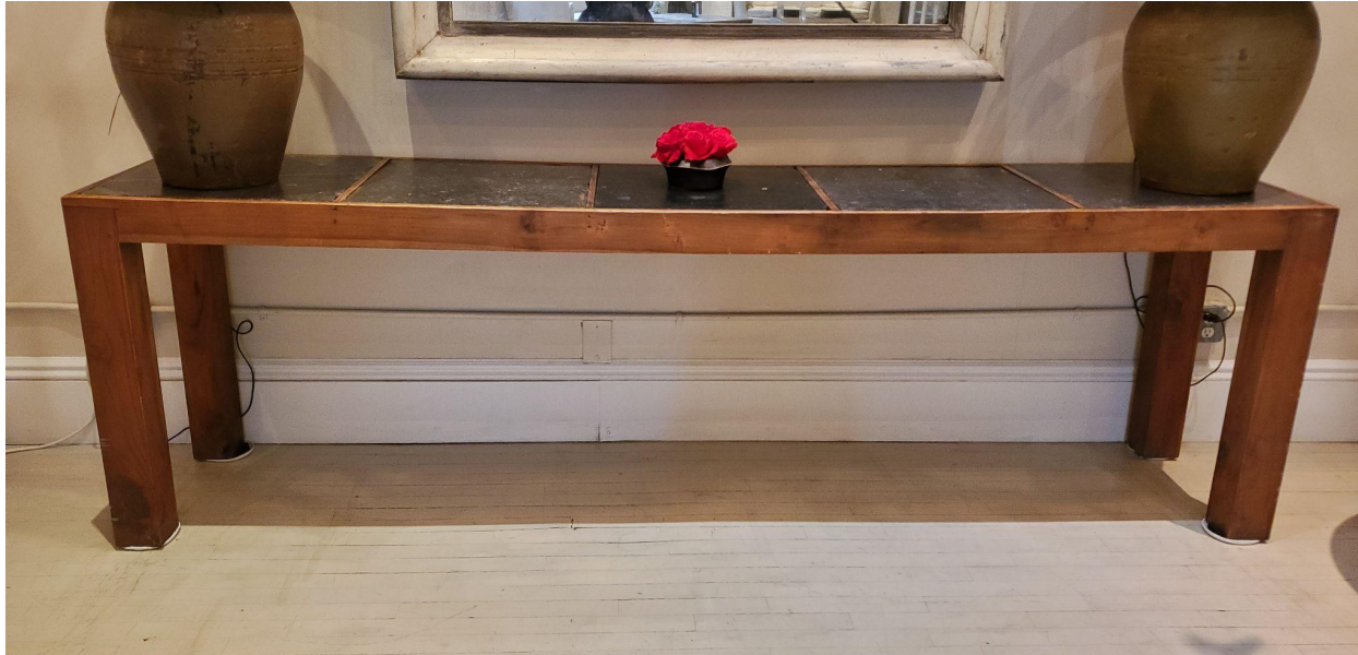
1 black stone antique table 103w x 21.5"d x 31 (Only available for The Loft)