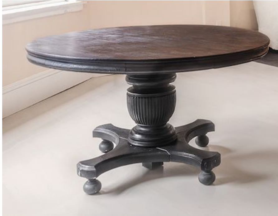
1 antique black table 59" round x 29"h