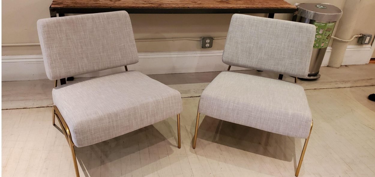
3 light blue arm chairs