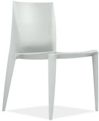
30 Bellini Chairs off White ($5.50 each)