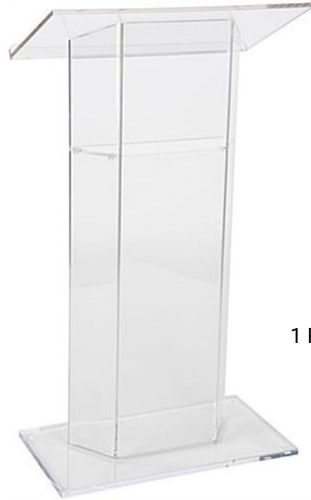
1 Podium ($100)